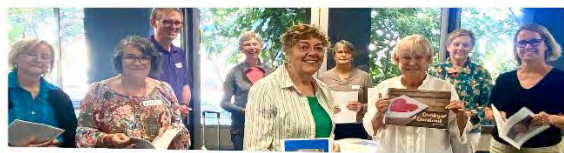
Welcome back to Calvary